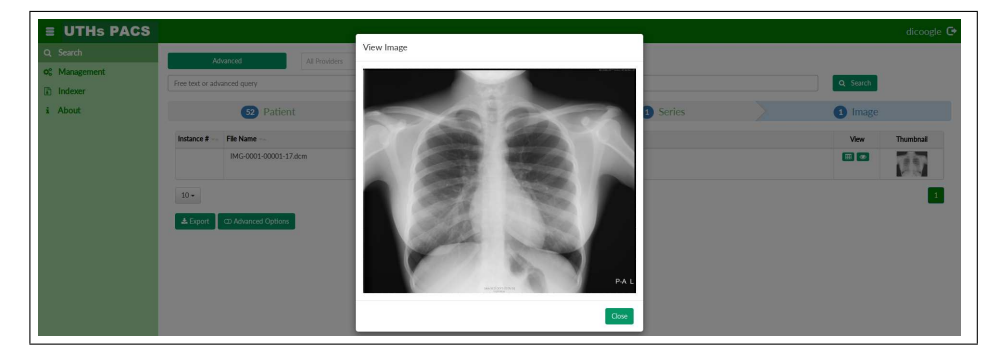
Fig. 2. Screenshot of the Prototype Picture Archiving and Communication System

Using the content rendered on the search result page, the user can then browse to the desired medical image using the DICOM hierarchy [8], making it possible for patient, study, series and image data to be accessed. The access to specific images associated with a Study Series has a provision for users to view thumbnails of medical images.