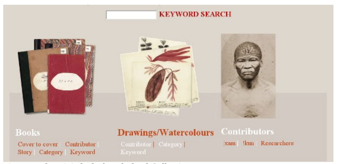
Figure 1. The Digital Bleek and Lloyd Collection

The Bleek and Lloyd collection is a 19<sup>th</sup> century compilation of notebooks and drawings comprising of linguistic and ethnographic work of Lucy Lloyd and Wilhelm Bleek on the life of the |Xam and !Kun Bushmen people of Southern Africa. In 2003, the Lucy Lloyd Archive and Research centre at the University of Cape Town embarked on a large scale digitisation project and all the artefacts were scanned and corresponding representation information generated.